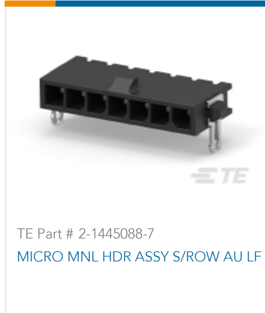
TE Part # 2-1445088-7 MICRO MNL HDR ASSY S/ROW AU LF