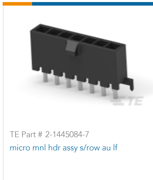
TE Part # 2-1445084-7 micro mnl hdr assy s/row au lf