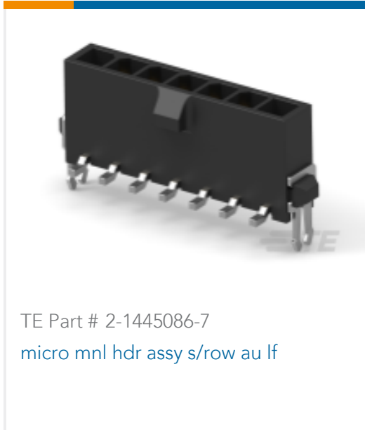
TE Part # 2-1445086-7 micro mnl hdr assy s/row au lf