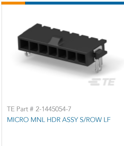
TE Part # 2-1445054-7 MICRO MNL HDR ASSY S/ROW LF