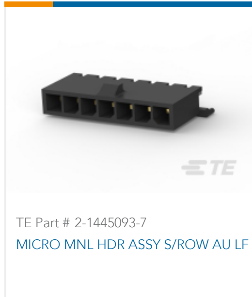
TE Part # 2-1445093-7 MICRO MNL HDR ASSY S/ROW AU LF