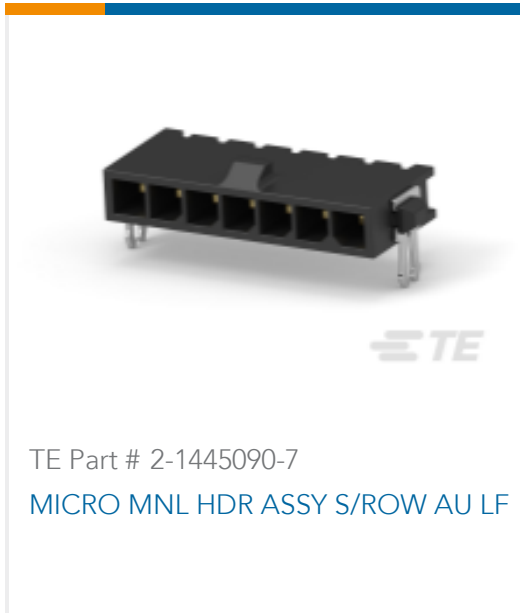
TE Part # 2-1445090-7 MICRO MNL HDR ASSY S/ROW AU LF