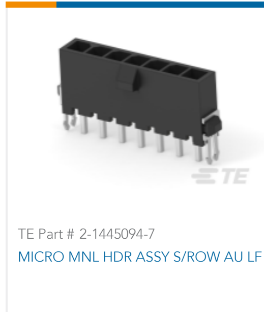
TE Part # 2-1445094-7 MICRO MNL HDR ASSY S/ROW AU LF