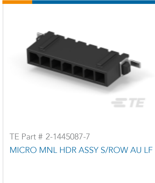
TE Part # 2-1445087-7 MICRO MNL HDR ASSY S/ROW AU LF