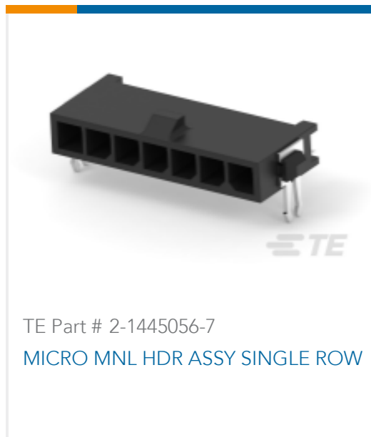
TE Part # 2-1445056-7 MICRO MNL HDR ASSY SINGLE ROW