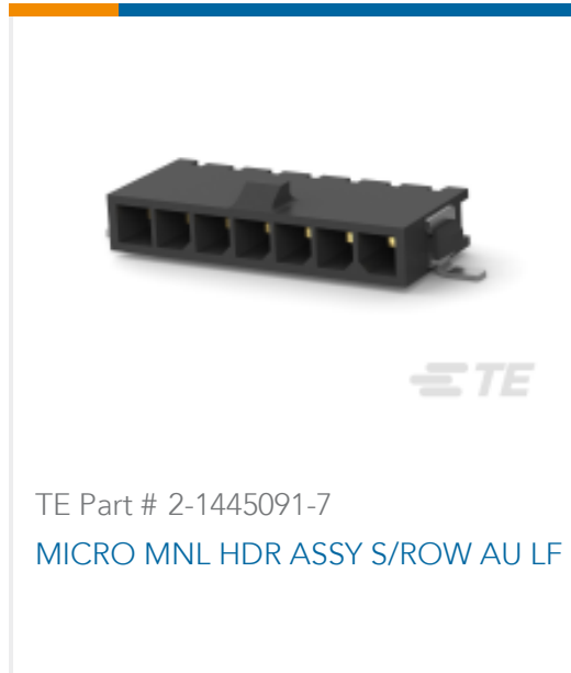
TE Part # 2-1445091-7 MICRO MNL HDR ASSY S/ROW AU LF