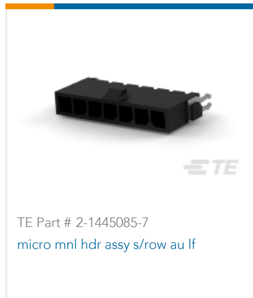
TE Part # 2-1445085-7 micro mnl hdr assy s/row au lf