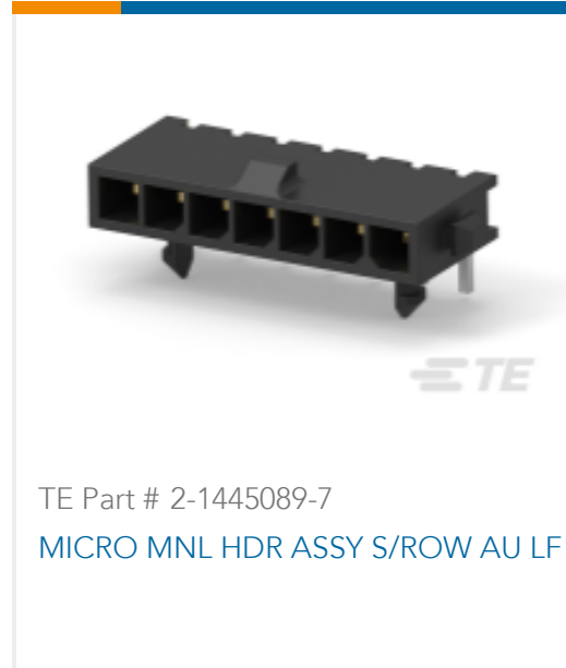
TE Part # 2-1445089-7 MICRO MNL HDR ASSY S/ROW AU LF